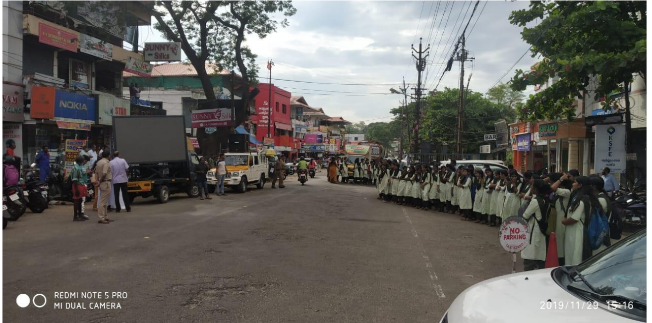
The NSS Volunteers participating in the Inauguration Ceremony