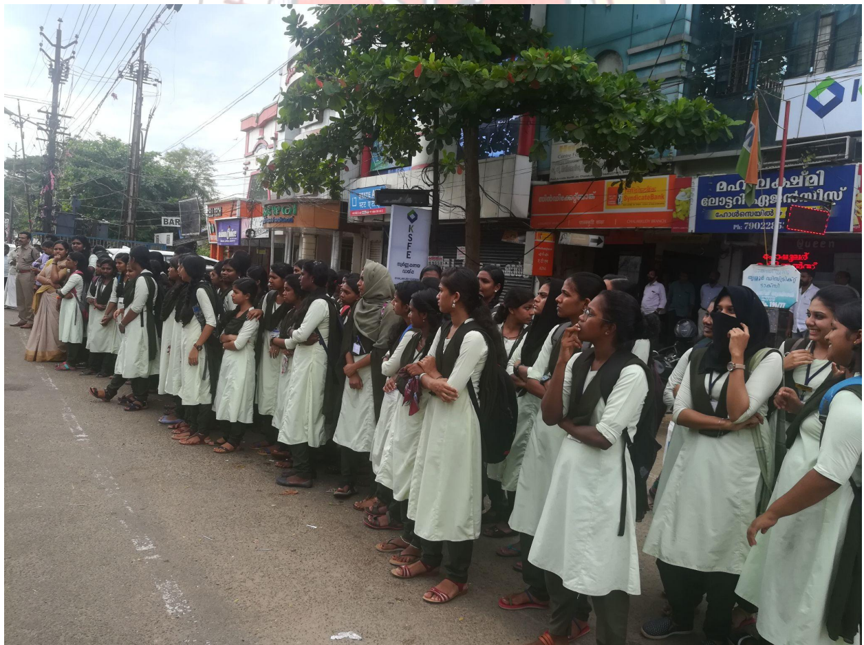
The NSS Volunteers intently listened to the Inaugural address.