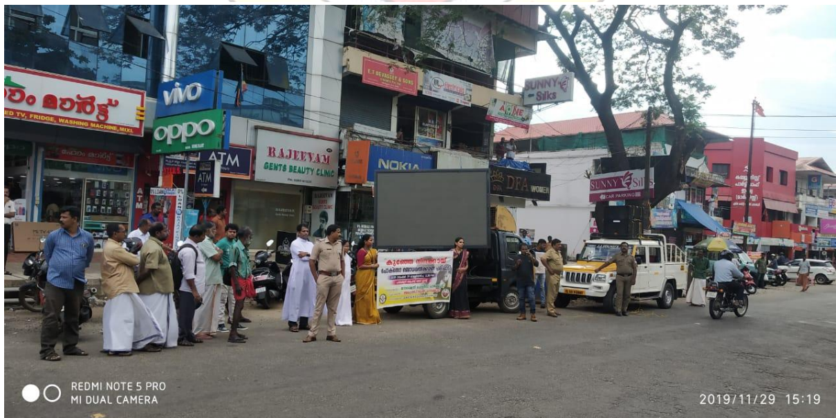
The Officials inaugurating the POCSO Rally

In order to effectively address the heinous crimes of sexual abuse and sexual exploitation of children through less ambiguous and more stringent legal provisions, the Ministry of Women and Child Development championed the introduction of the Protection of Children from Sexual Offences (POCSO) Act, 2012. The NSS volunteers participated in POCSO Act awareness programme” “Kunje Ninakayi” (Translated as Dear child, its for you ) organised by the Chalakudy police on 29/11/2019. The aim was to sensitize students and the citizens on POCSO related issues as child Sexual Abuse is a major concern, which is increasing day by day and children being most vulnerable section of the society are susceptible to physical and psychological abuse. Police professionals were the main resource persons of the programme.