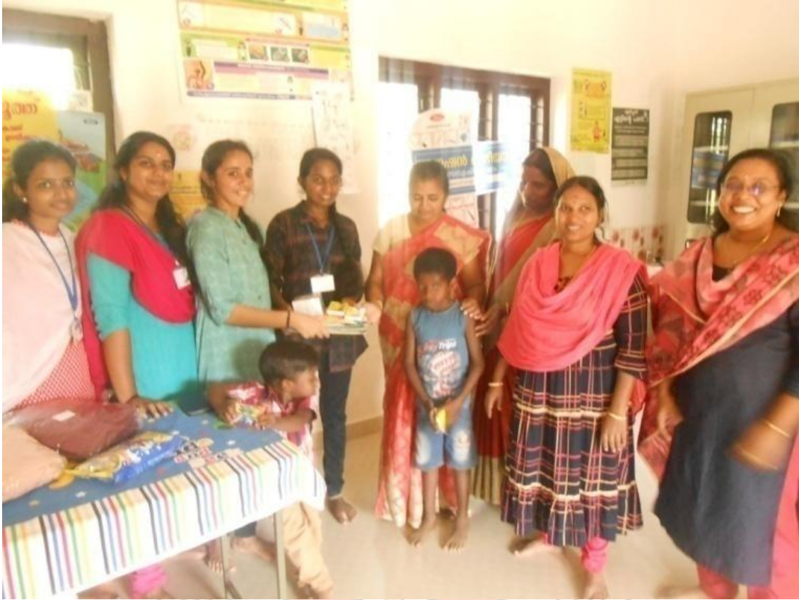
The NSS Coordinators, NSS Volunteers, the respective Volunteers of Anappantham tribal colony give the necessary items to the Anappantham Tribal kids.