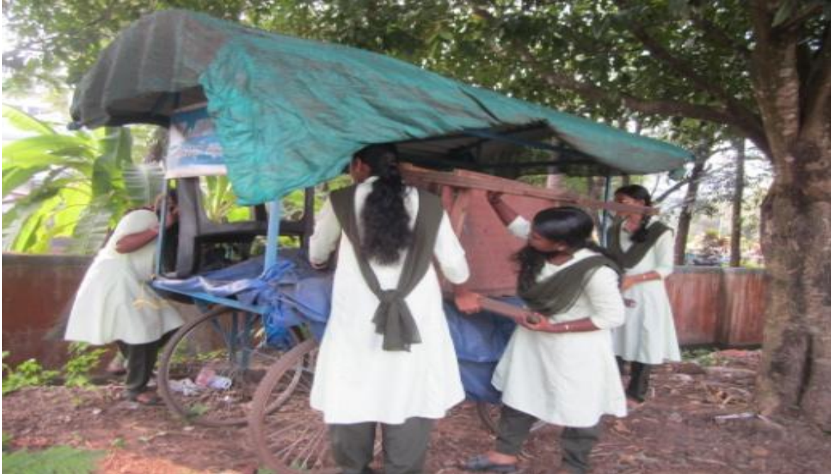
Students cleaning the outside premises of the college