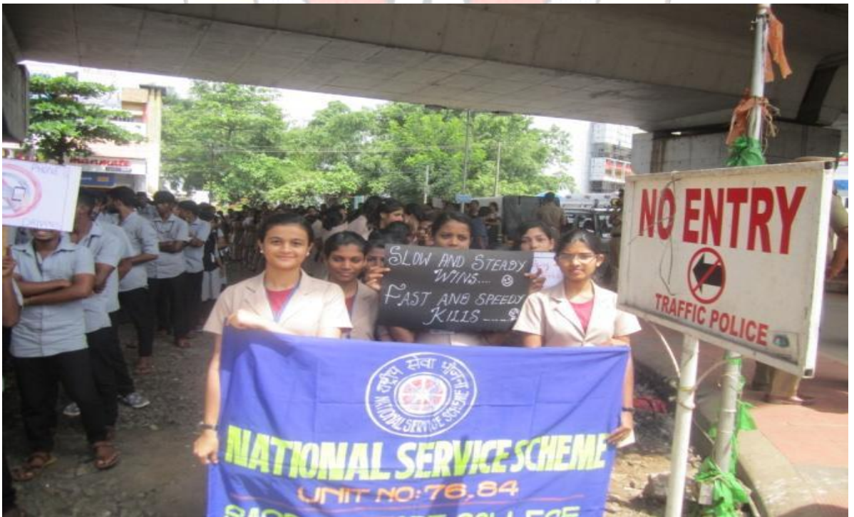
STUDENTS RALLYING IN CHALAKUDY TOWN.