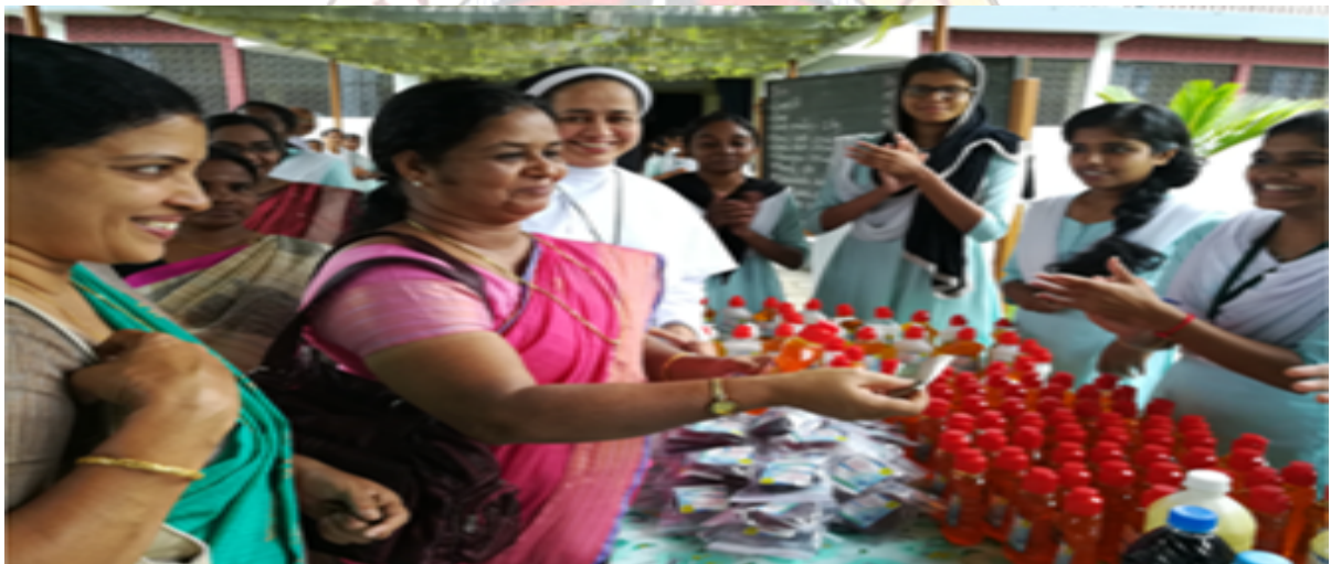
PEOPLE BUYING THE PRODUCTS