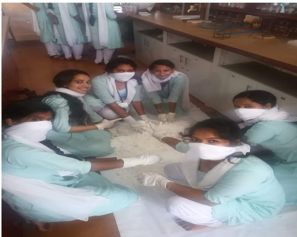
STUDENTS PARTICIPATING IN THE WORKSHOP.