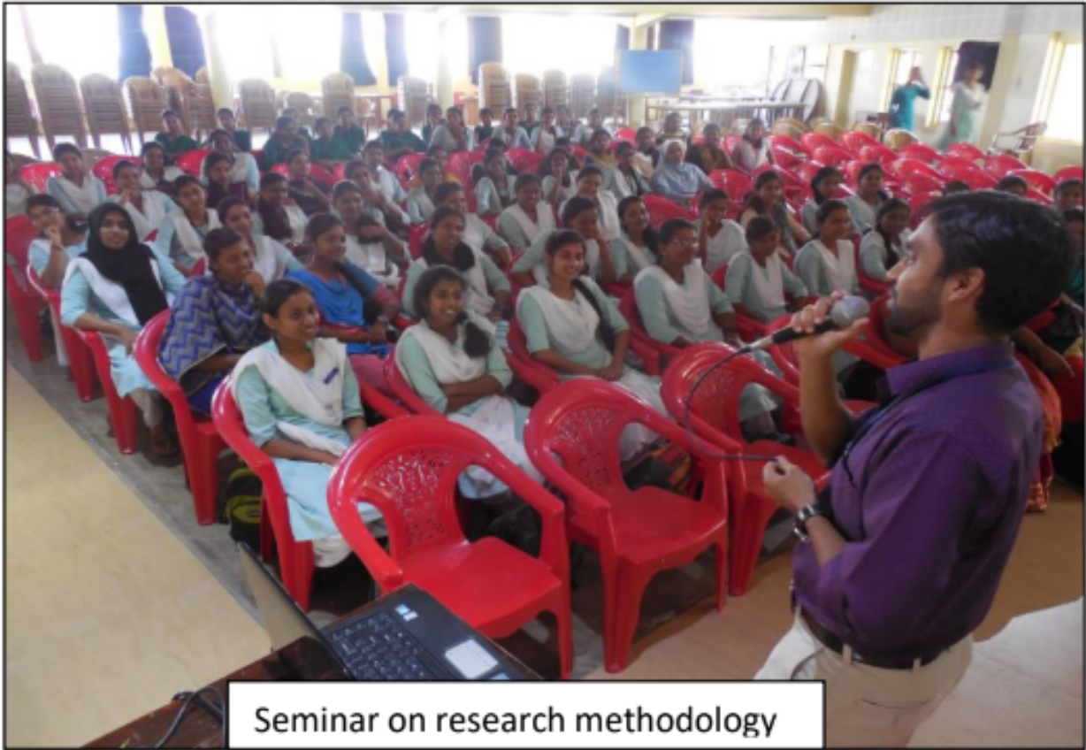
Seminar on research methodology