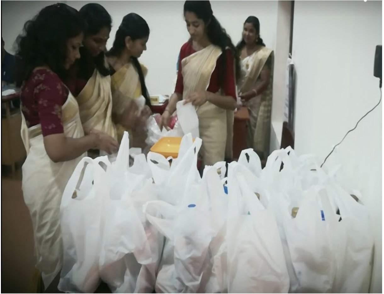
STUDENTS PREPARING AND PACKING THE PRODUCTS.