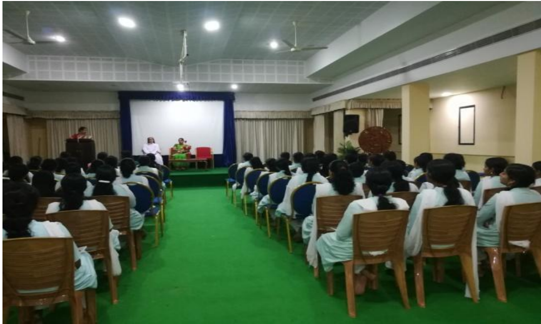
STUDENTS ATTENDING THE SESSION.