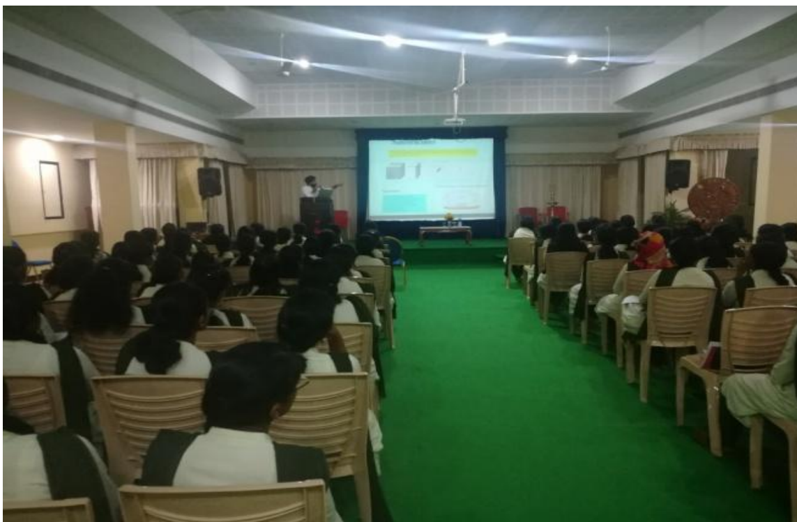
STUDENTS ATTENDING THE SESSION.