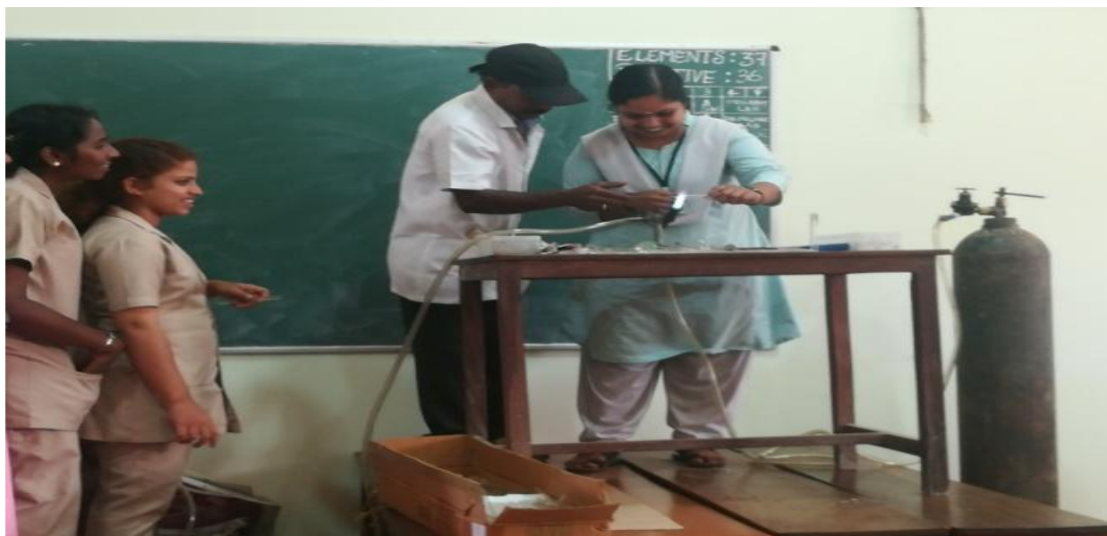
WORKSHOP ON GLASS BLOWING:STUDENTS PARTICIPATING IN THE PROGRAM.