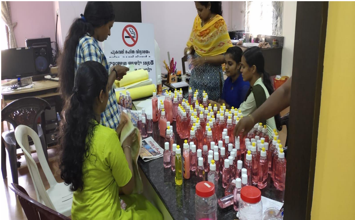
STUDENTS PACKING THE HAND WASHES AS PART OF THE BREAK THE CHAIN CAMPAIGN.