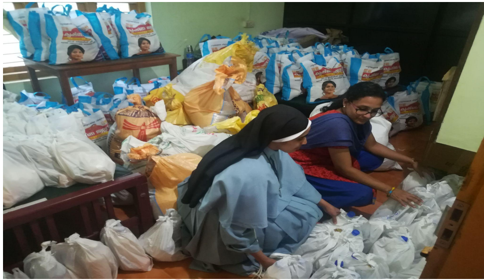
The Faculty members arranging the Essential Kit before hand