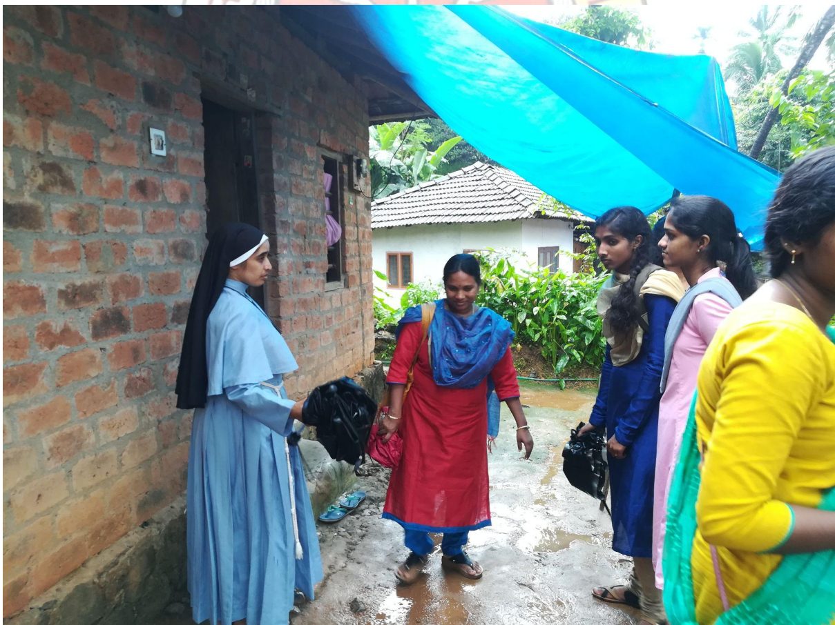
The teachers and the students actively participated in the distribution of the essential kit.