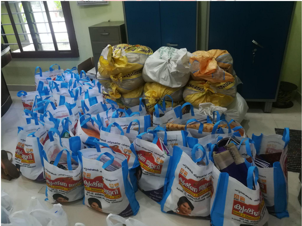
The Essential Kit collected for the flood affected Items