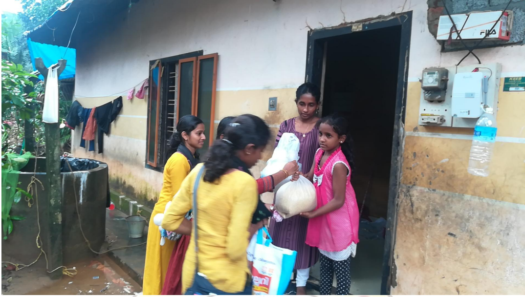
The NSS Volunteers giving the essential kit to the flood affected victims