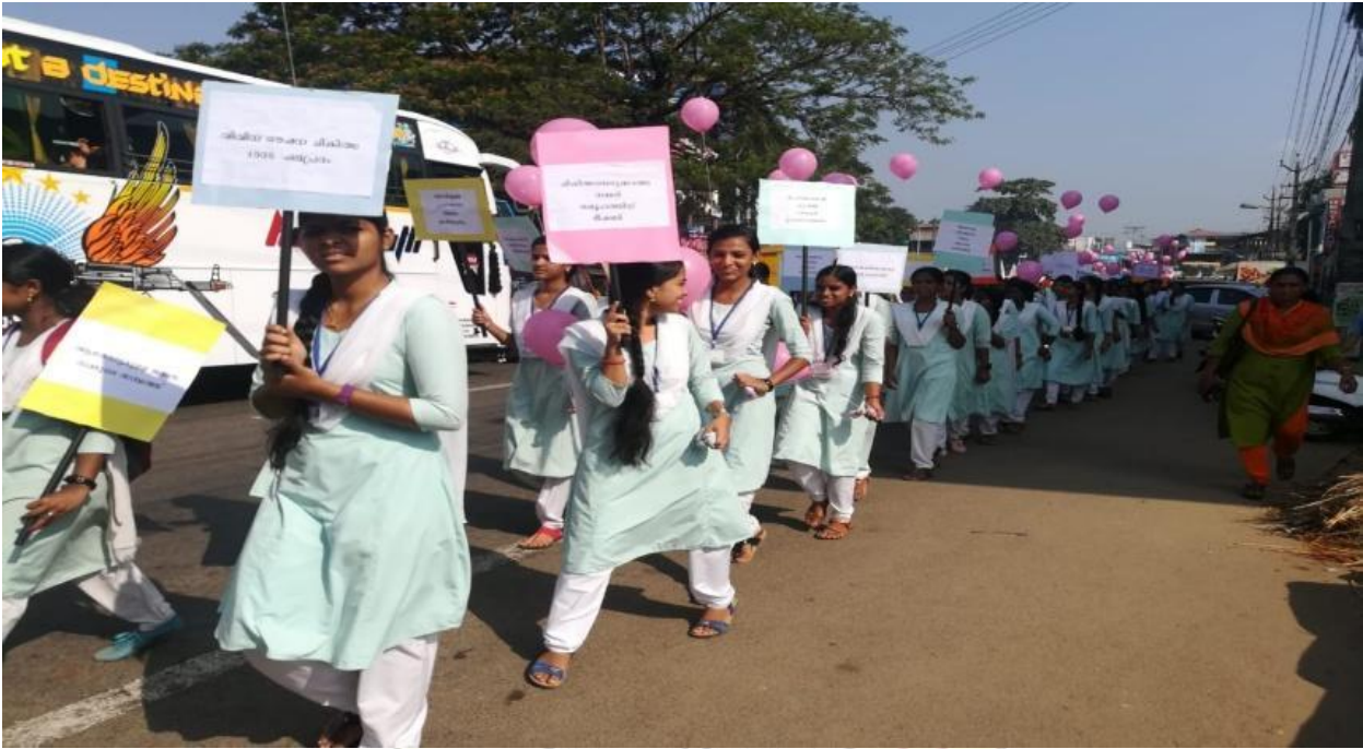
The NSS Volunteers actively participated in the Rally at Chalakudy Town.