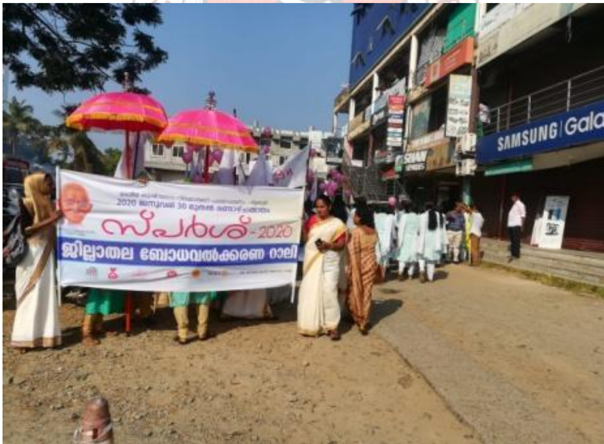
The banner of the Leprosy Awareness Rally held by the Chalakudy Government hospital Volunteers.