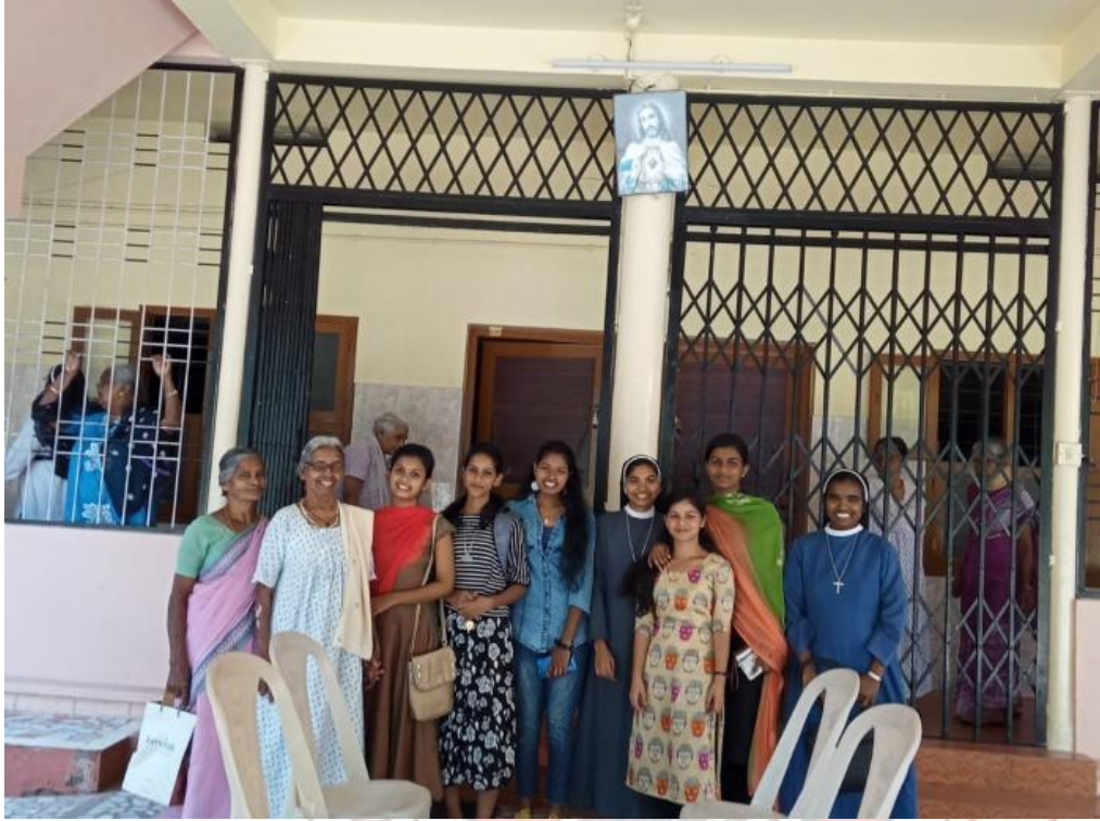
The NSS Volunteers with the Old Age citizens at Meloor.