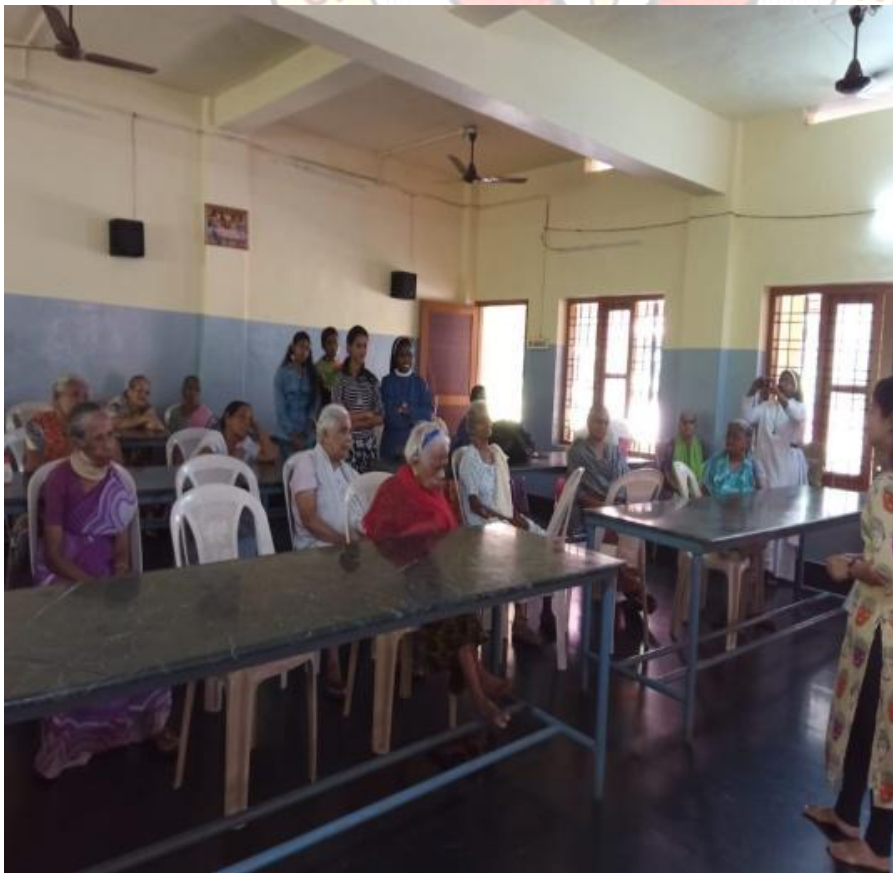
The NSS Volunteers actively interacting with the Old Age citizens at Meloor