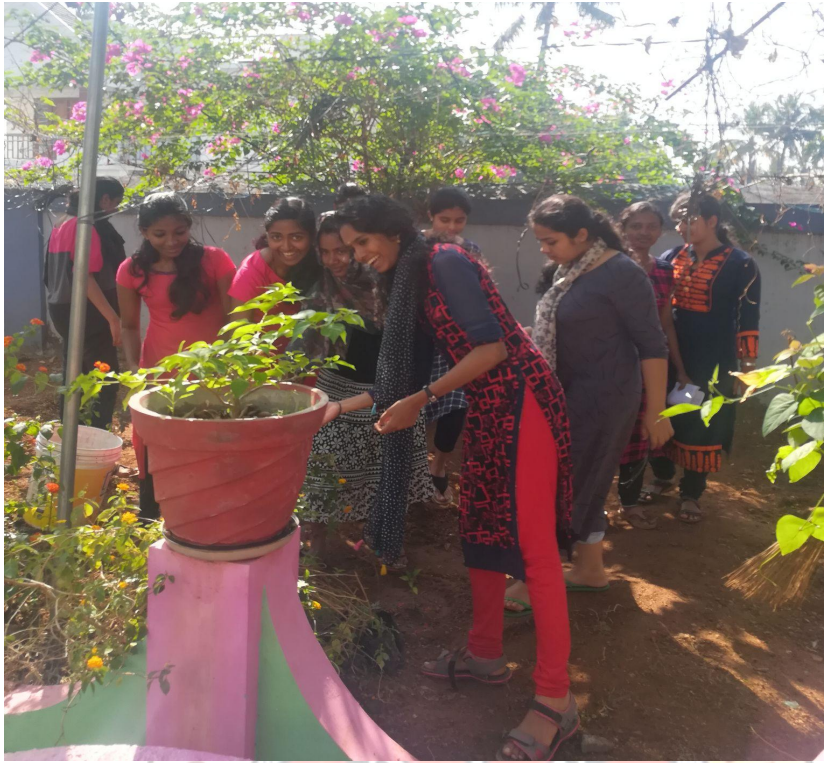
The NSS Volunteers actively participated in watering the plants at St.Mary's LP School, Thiruthiparambu.