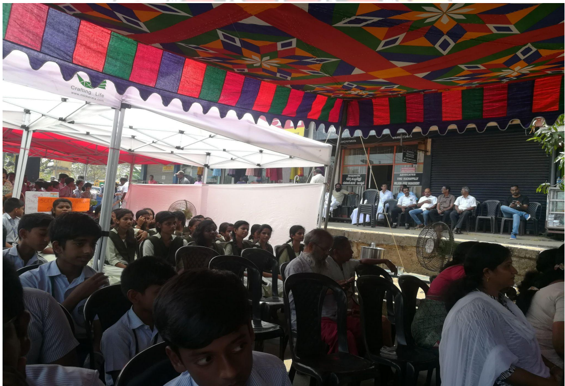
STUDENTS ATTENDING THE SESSION.