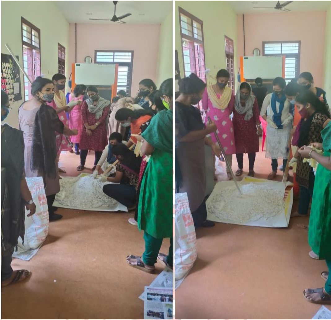
STUDENTS AND TEACHERS MAKING DETERGENTS.