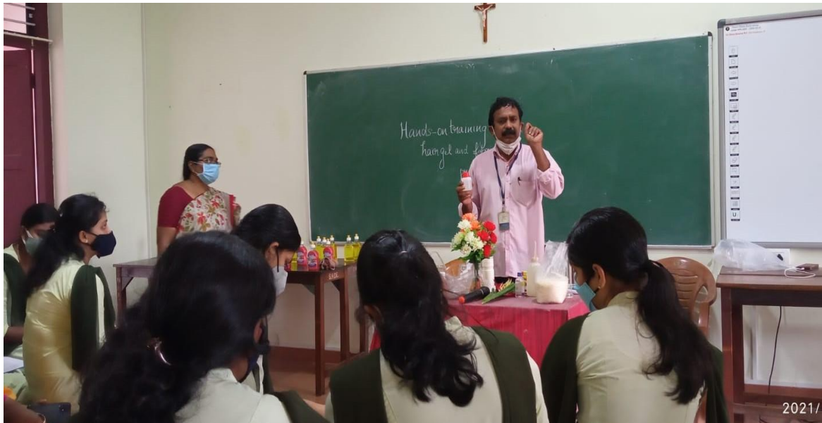
HANDS ON TRAINING ON HAIR GEL AND FABRIC CONDITIONER.