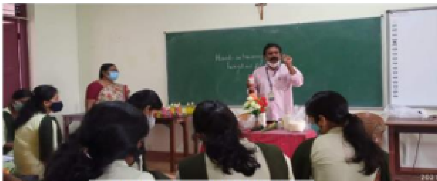
workshop on 25/10/2021