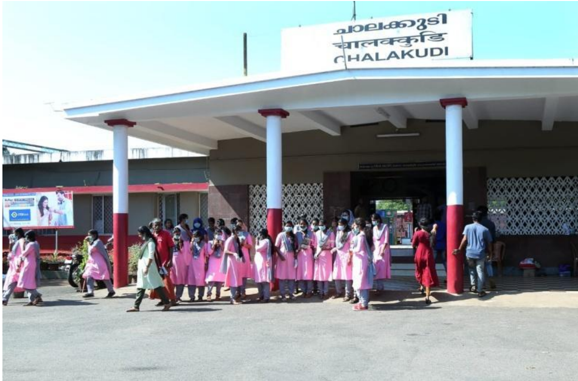
The NSS Volunteers divided themselves into different groups to clean different areas of the Railway Station.