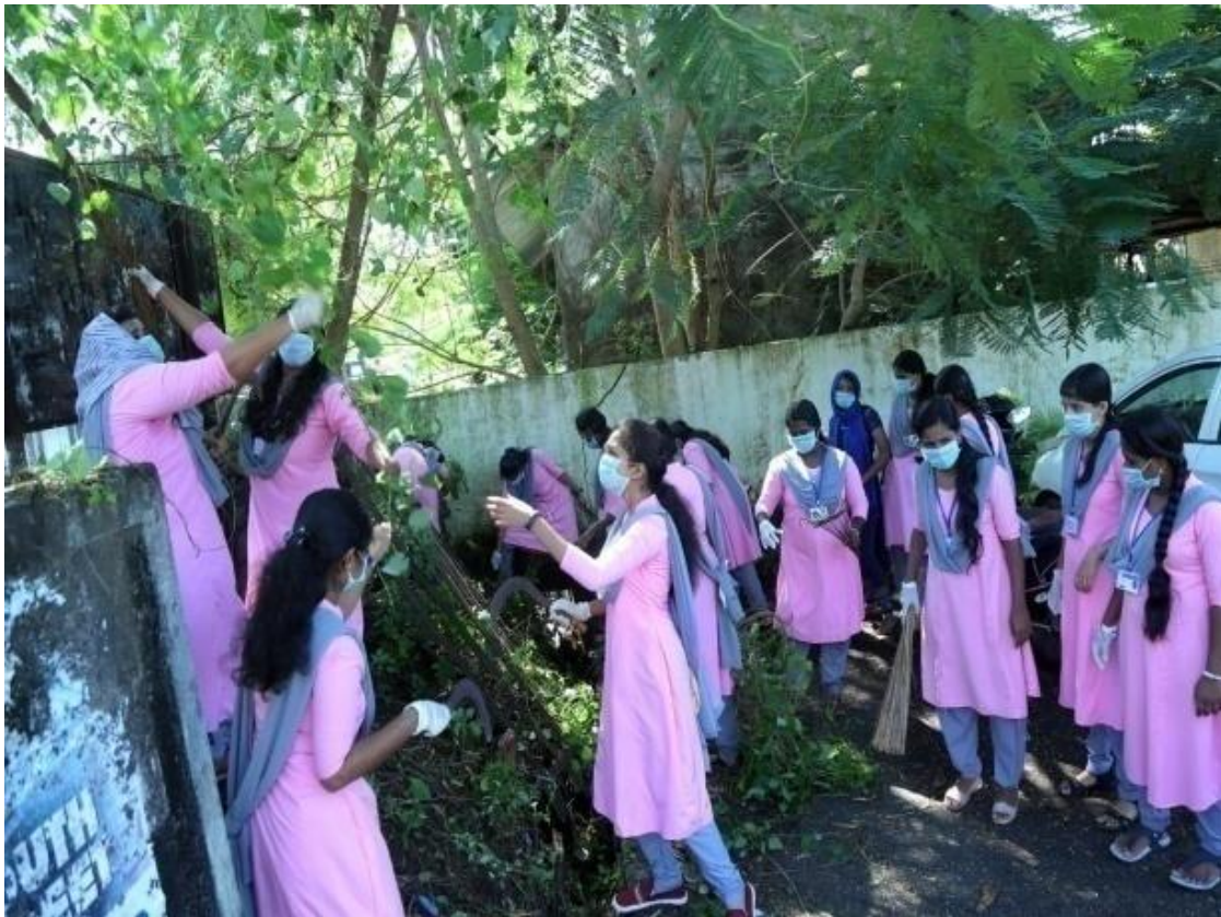
The NSS Volunteers cleaning the Railway Station Area