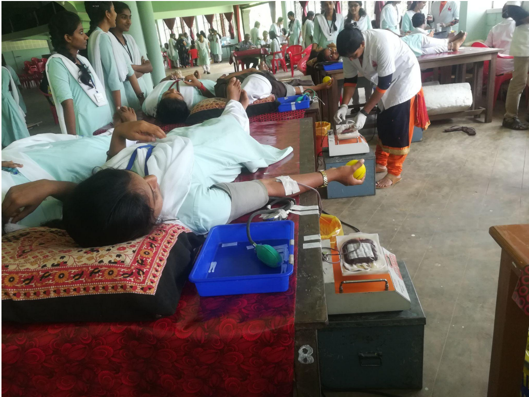
The NSS Volunteers participating in the blood donation Camp along with other IMA Blood Bank volunteers