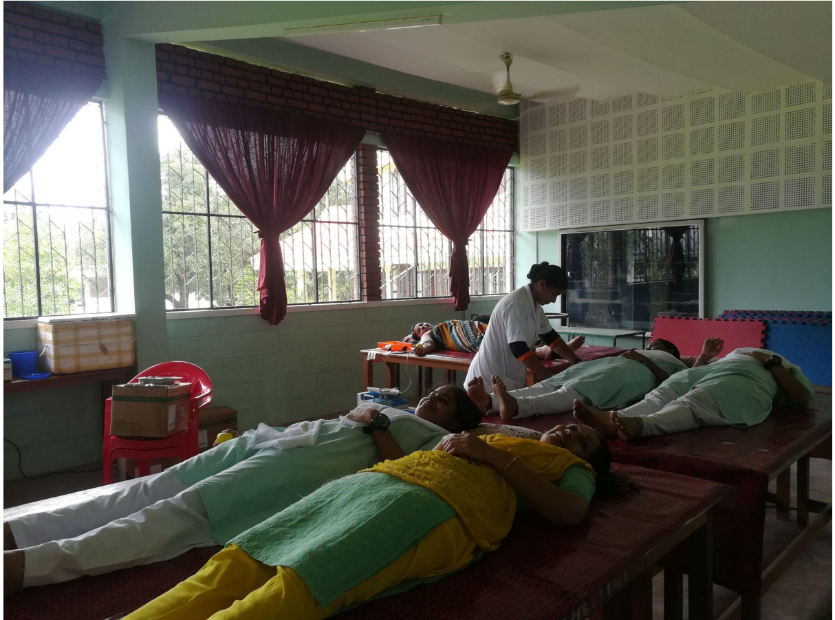
The NSS Volunteers participating in the blood donation Camp along with other IMA Blood Bank volunteers