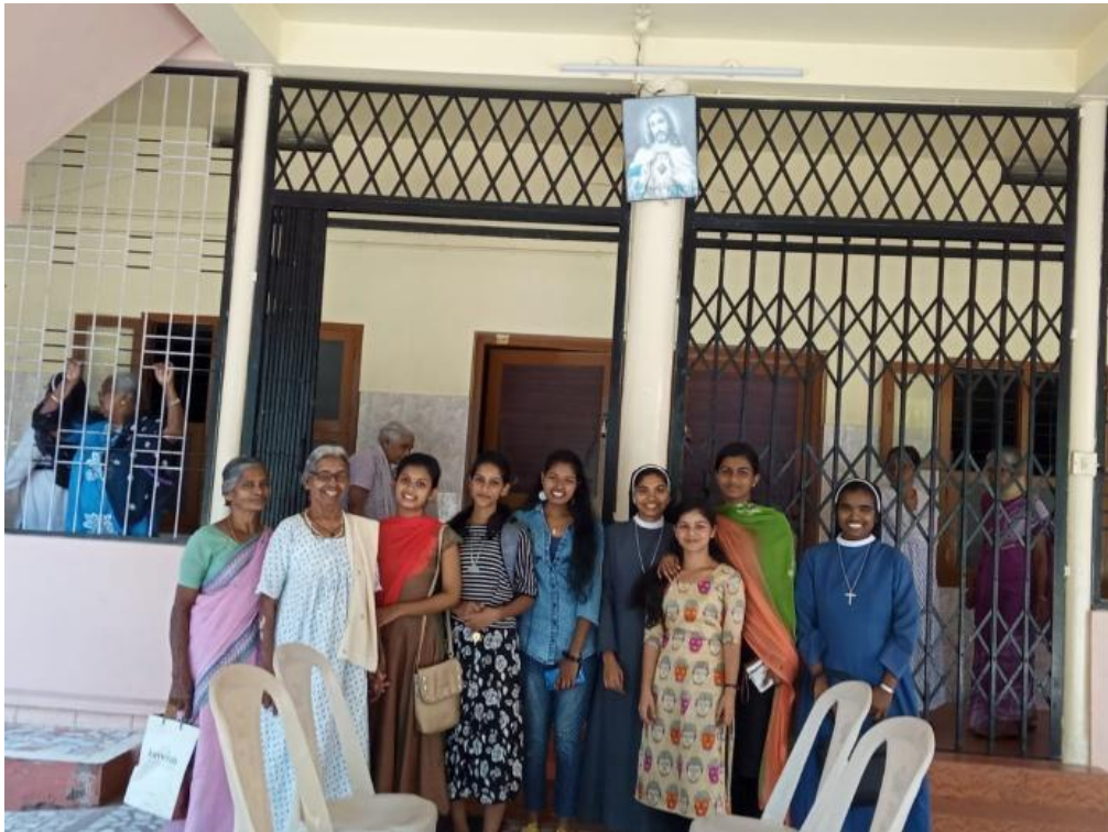
The NSS Volunteers with the Old Age citizens at Meloor.