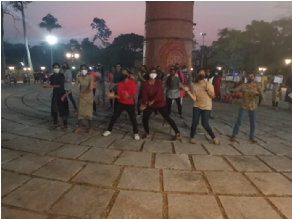
NSS volunteers performing flashmob to spread the messages of anti drugs campaign