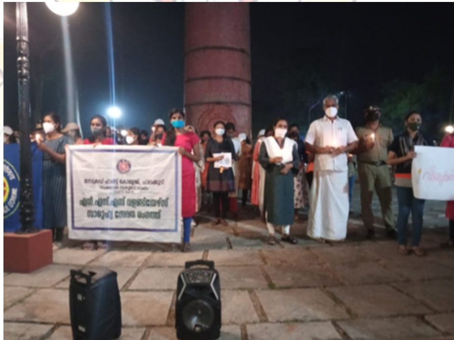
NSS units organised a flame lighting ceremony with public participation.