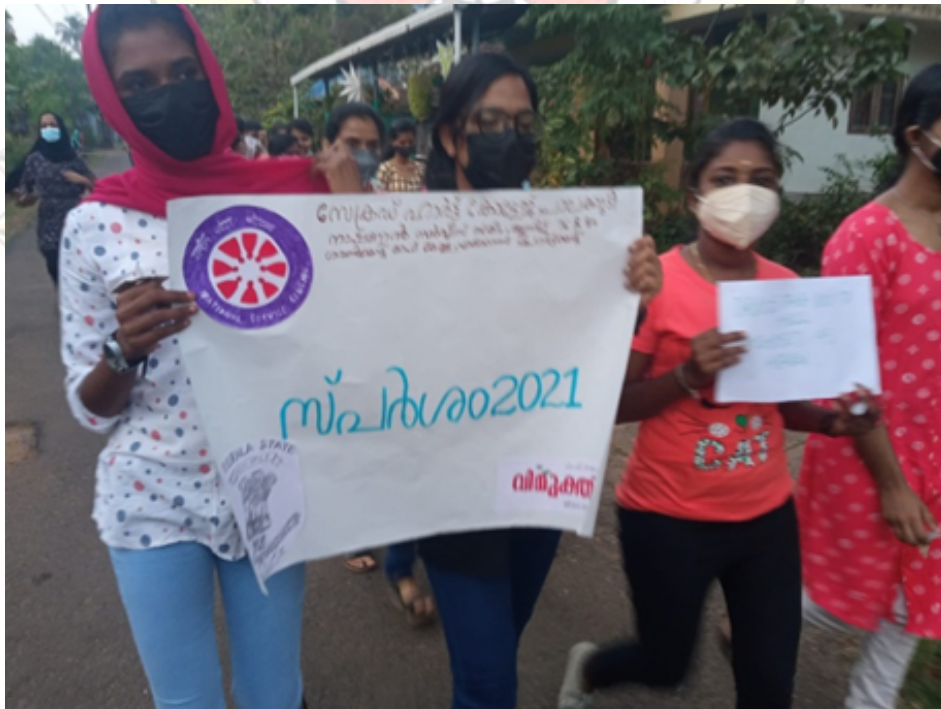
NSS volunteers rally placards to spread the message 'say no to drugs'