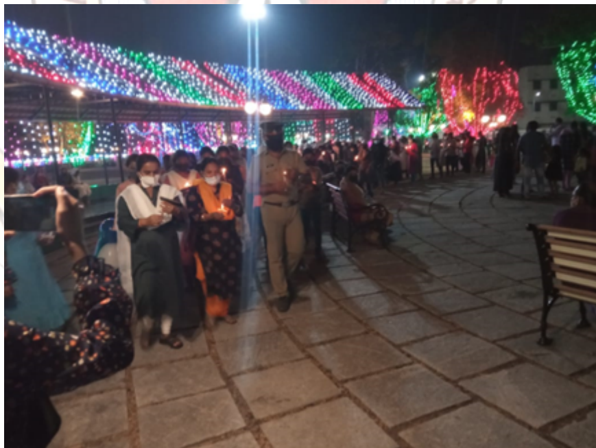
'Vimukhthi Jwala' procession at Kalabhavan Mani Park.