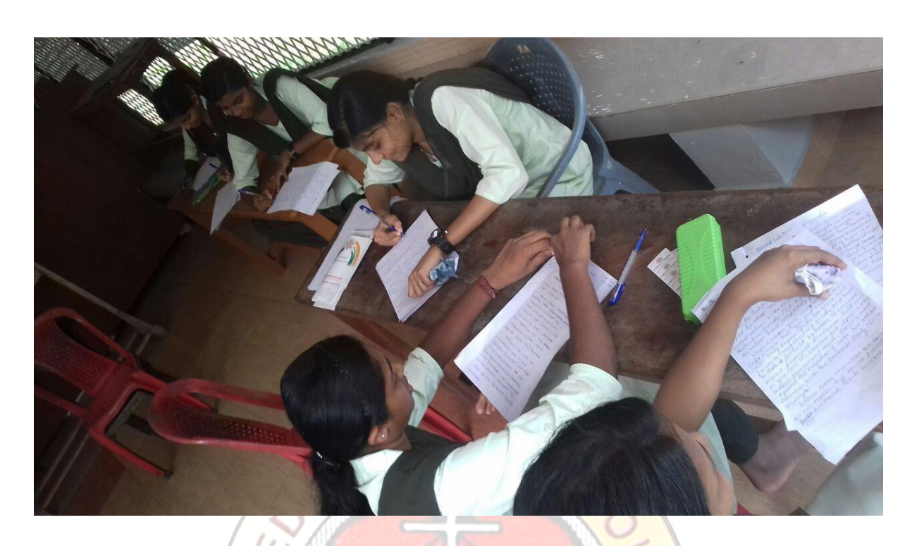
STUDENTS WRITING THEIR IDEAS AND MAKING PLACARDS AS PART OF COMMUNAL HARMONY WEEK.