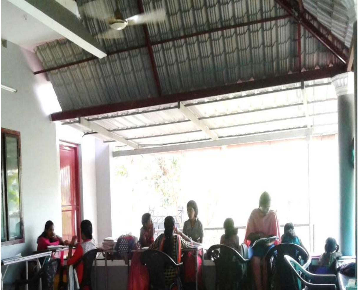
Tuition to Balika Sadhanam inmates by students, 22.10.2017