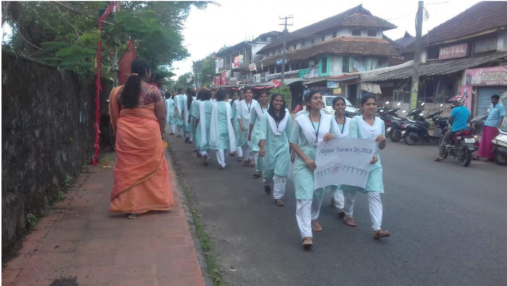
The procession of students to the Chalakudy Town spreading the message of Unity