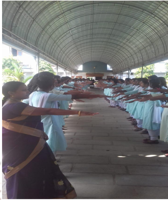
The NSS volunteers and the co-ordinators taking the pledge of truth to oneself and others at the College Premise