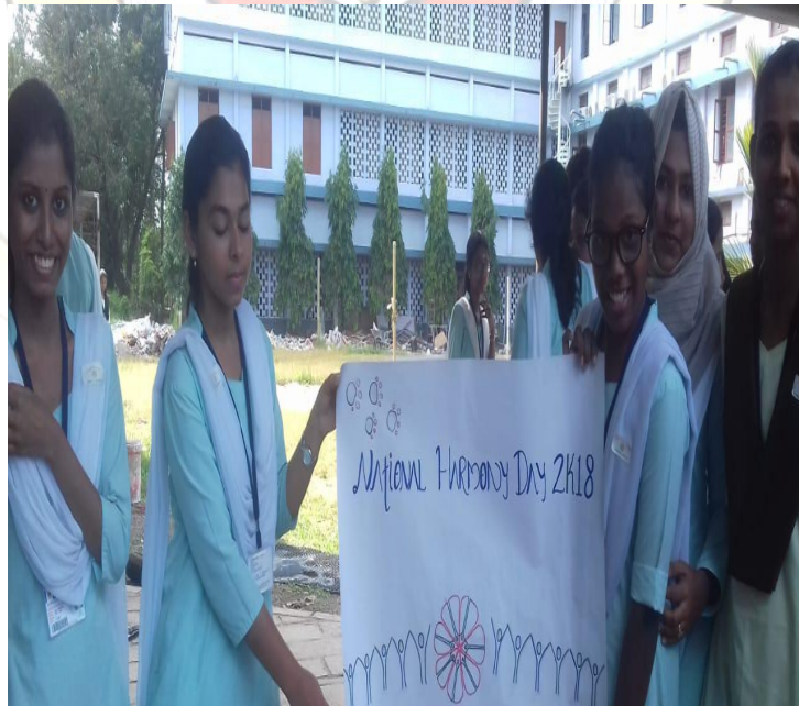
The Students displaying the placard which was used in the rally