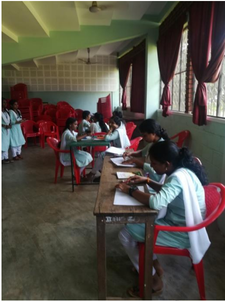
14. SWACH BHARATH ABHIYAN (PLEDGE)