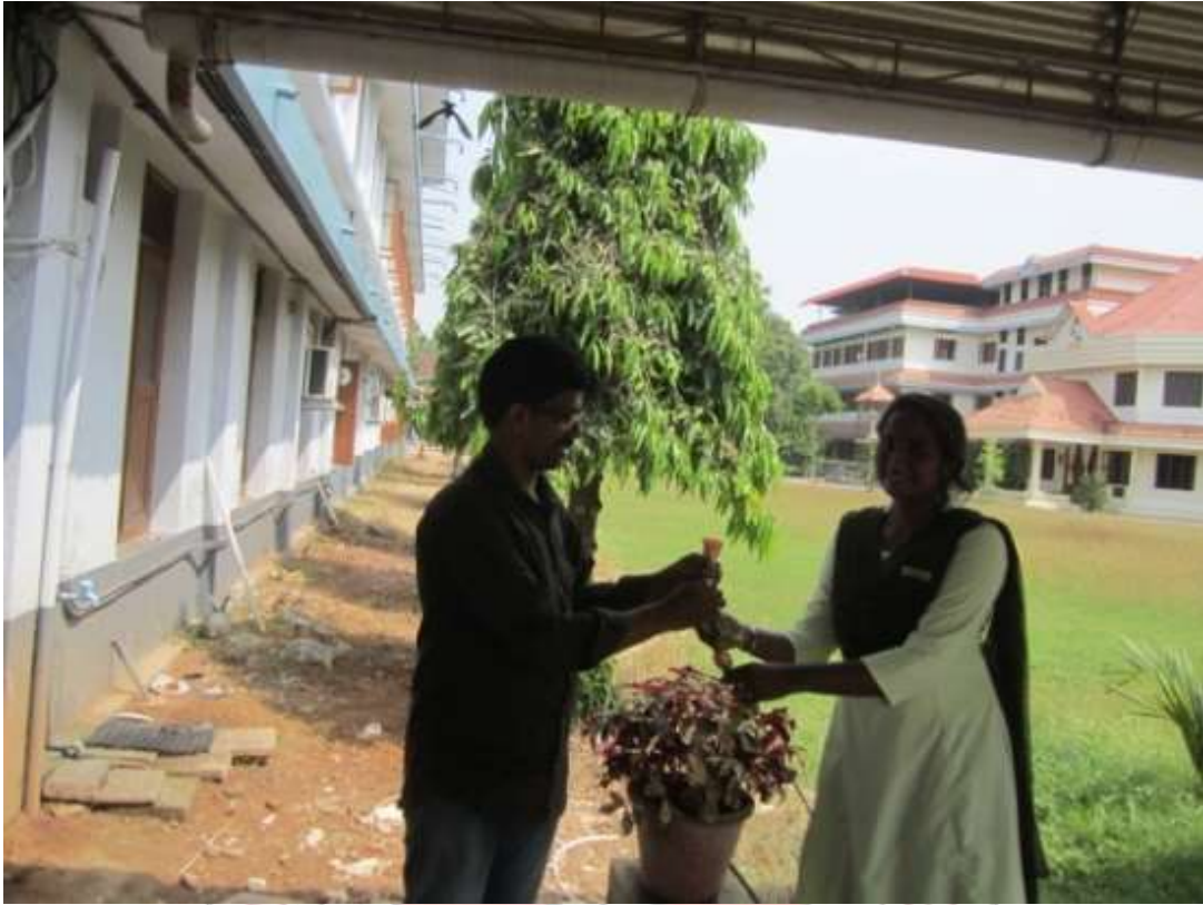
24.Civic right day