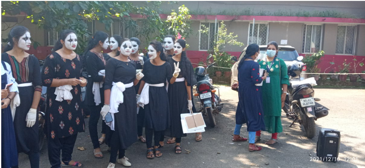
Students before the commencement of mime at Chalakudy Railway Station