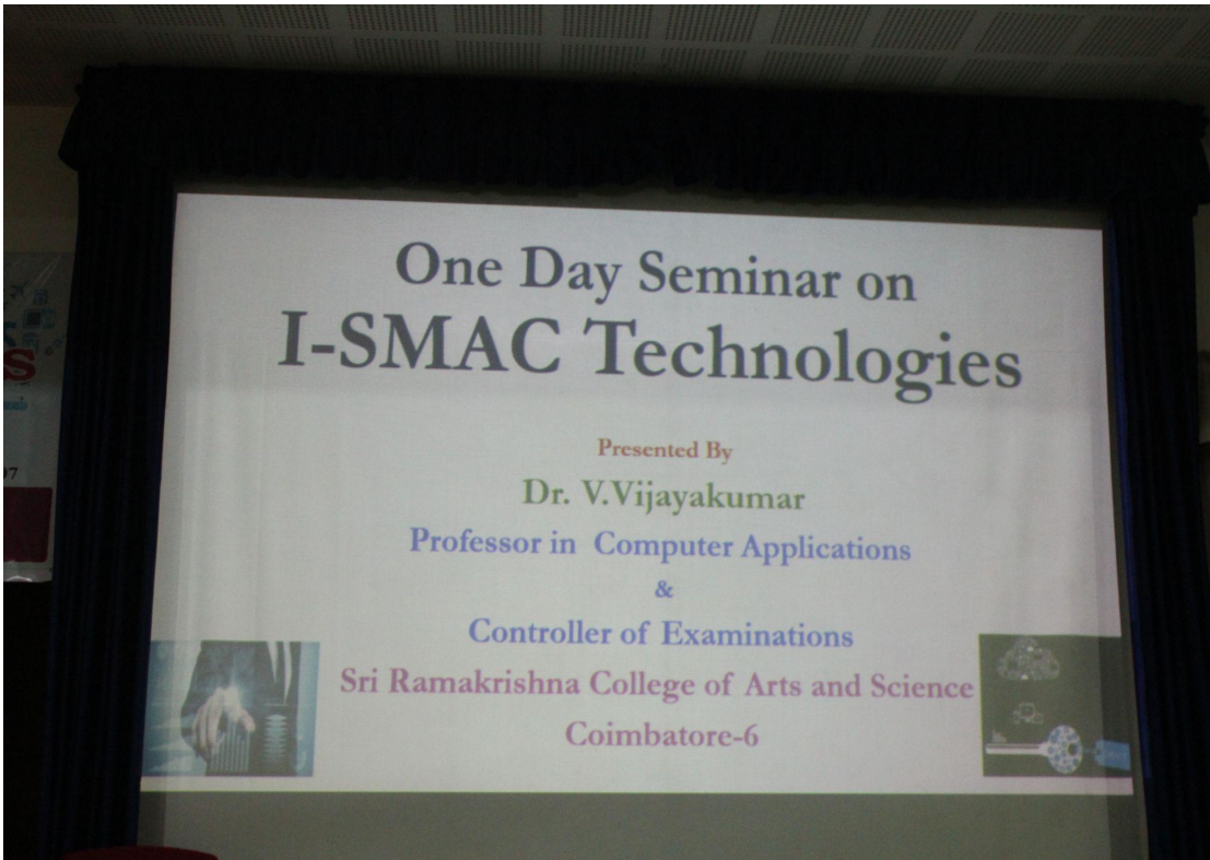
POWERPOINT PRESENTATION OF THE WEBINAR.