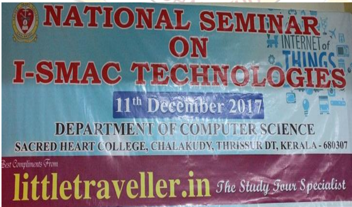
BANNER FOR THE SPECIAL OCCASION.