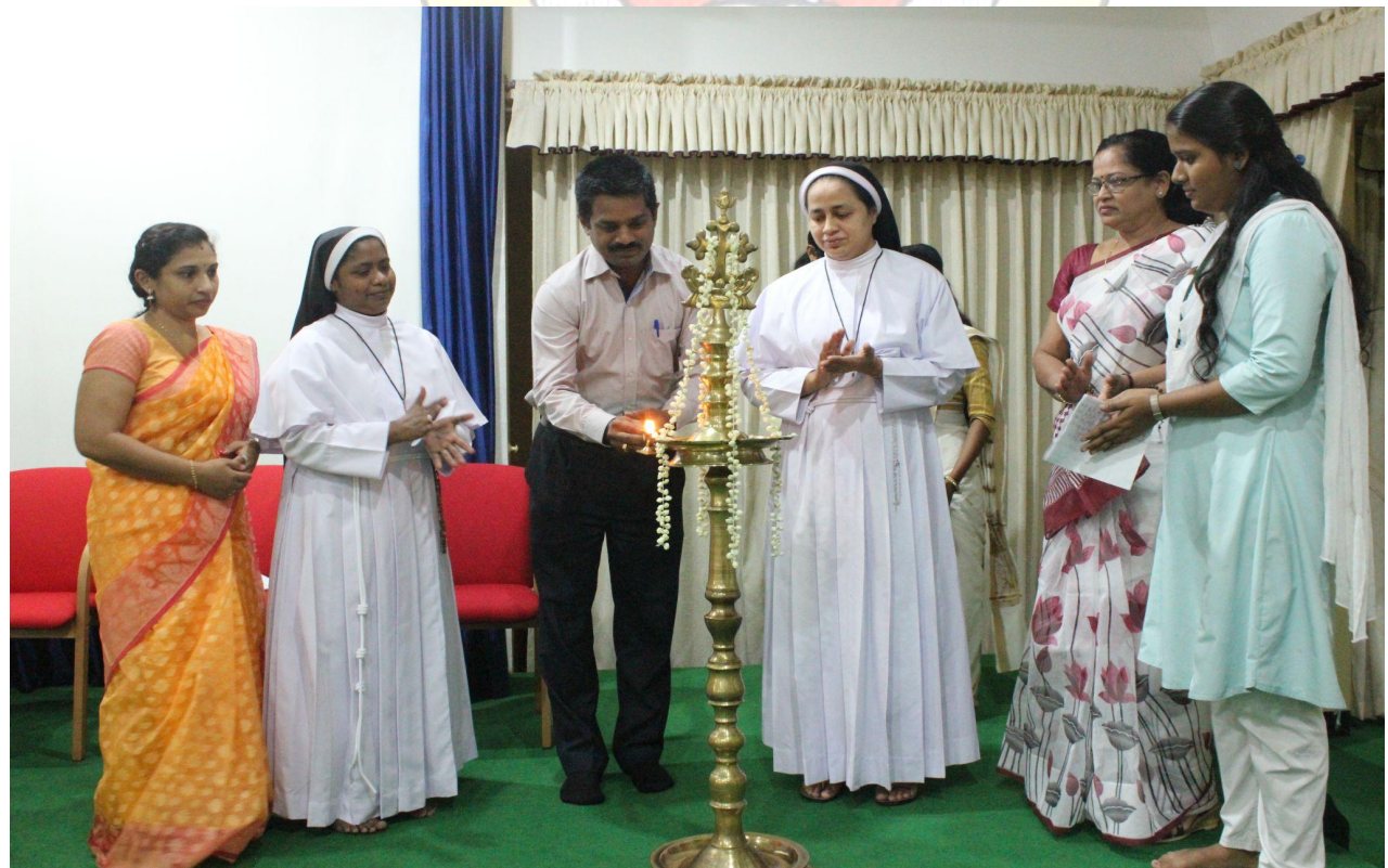
INAUGURATION CEREMONY LIGHTNING THE LAMP BY THE CHIEF GUEST