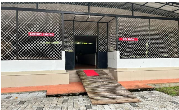
Sick room facility at the college