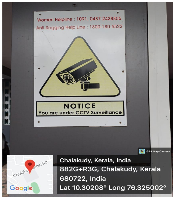
CCTV cameras installed in each floor