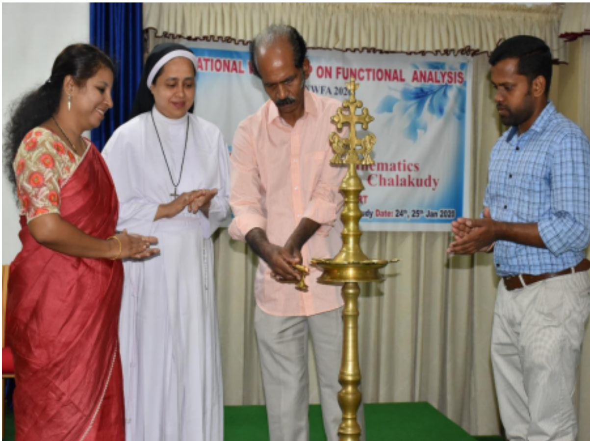
Inaugural Function of National Workshop on Functional analysis, 2020