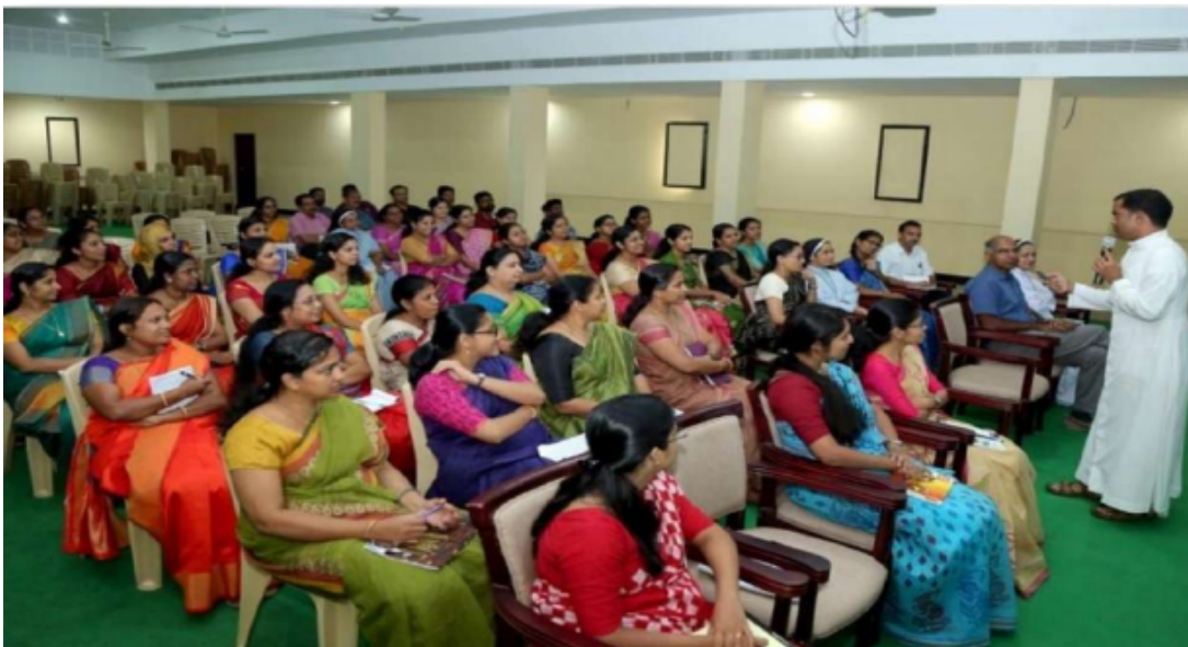
During the session