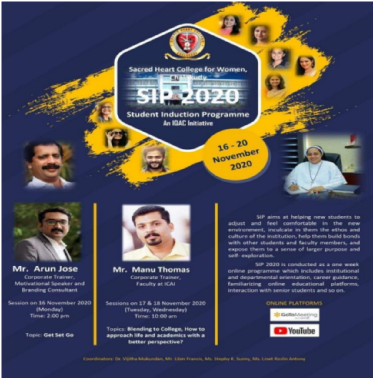
Brochure of the SIP programme conducted on 16-11-2020