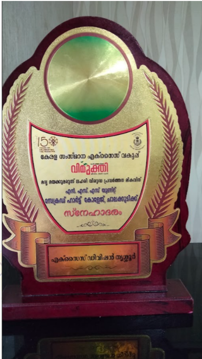
Memento Of Appreciation From Kerala Excise Department For The Activities Performed By Nss Unit Of Sacred Heart College As Part Of Vimukthi Mission