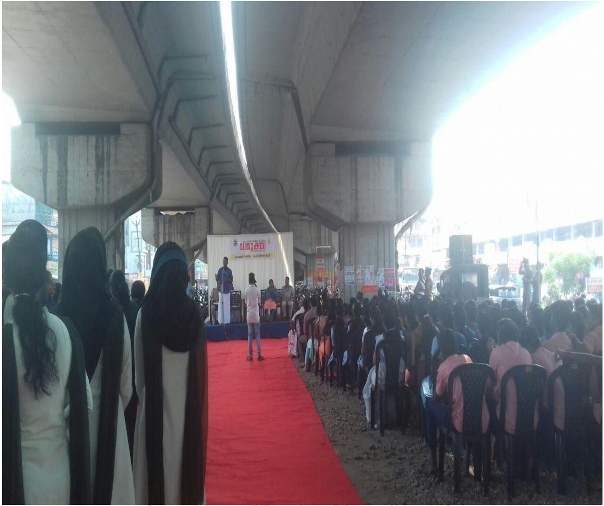
Students Attending The Vimukthi Program.