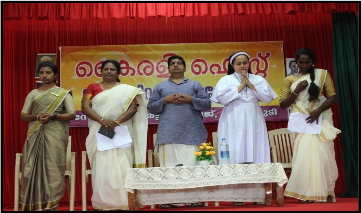
1/11/2017 - Kairali Fest – Inauguration