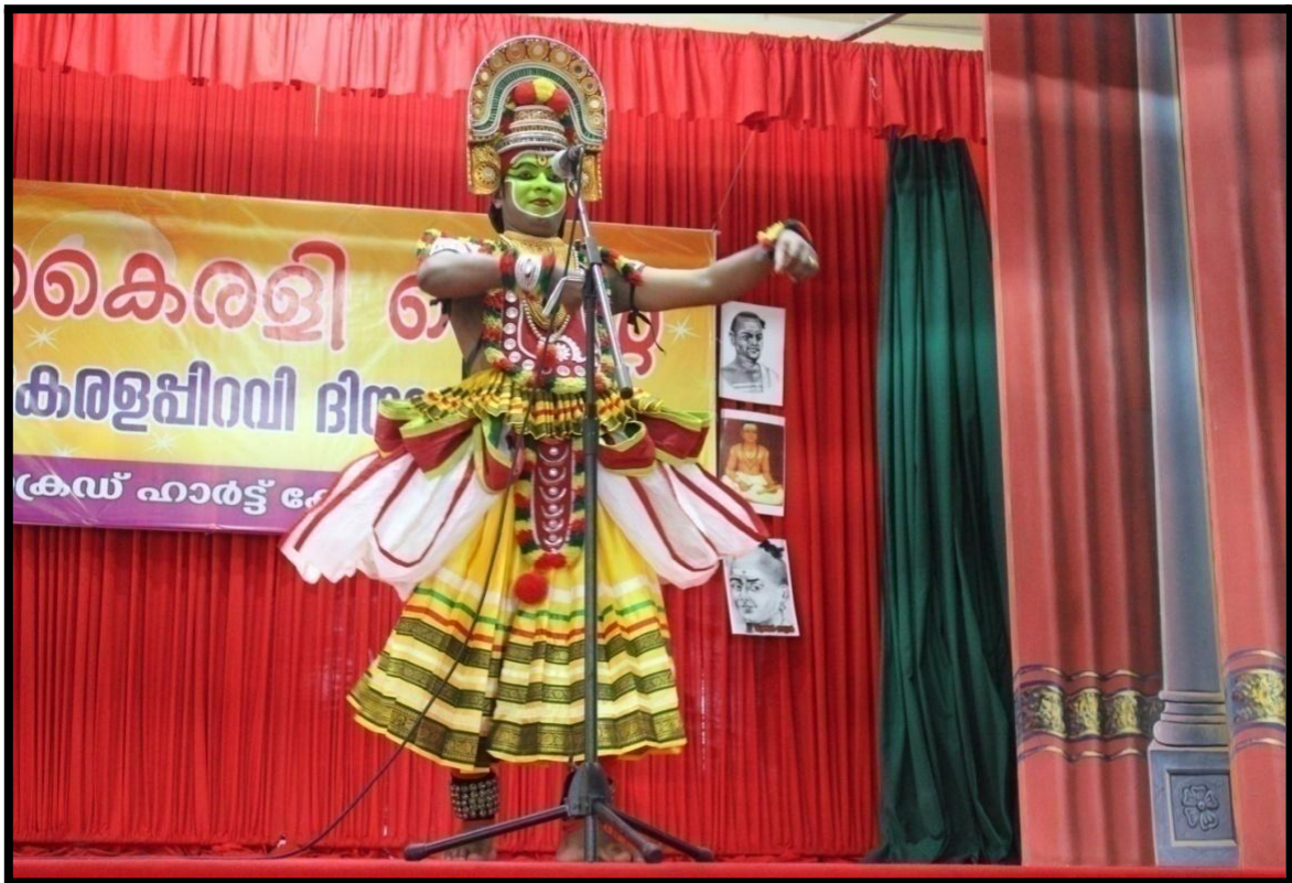
1/11/2017 - Kairali Fest – Ottamthullal (traditional folk art form of Kerala)