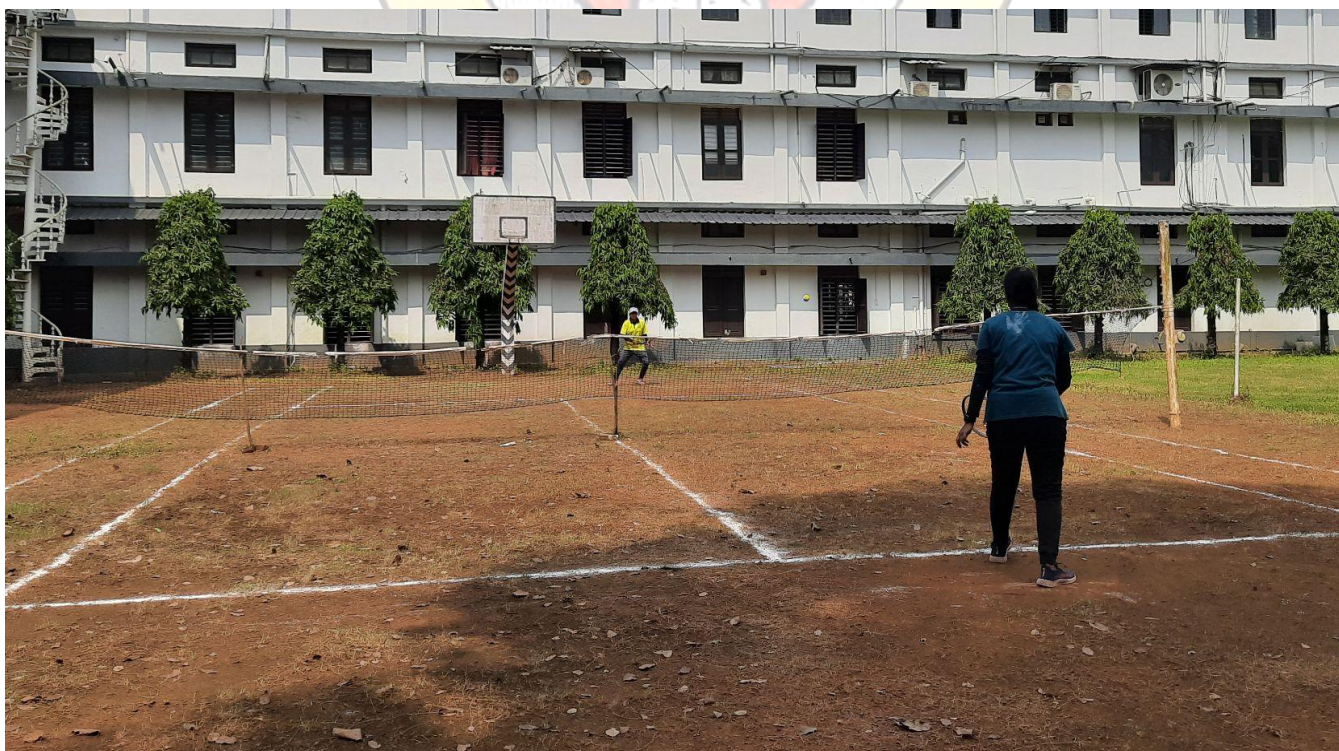
Students practising the basic grips and different racquet swings