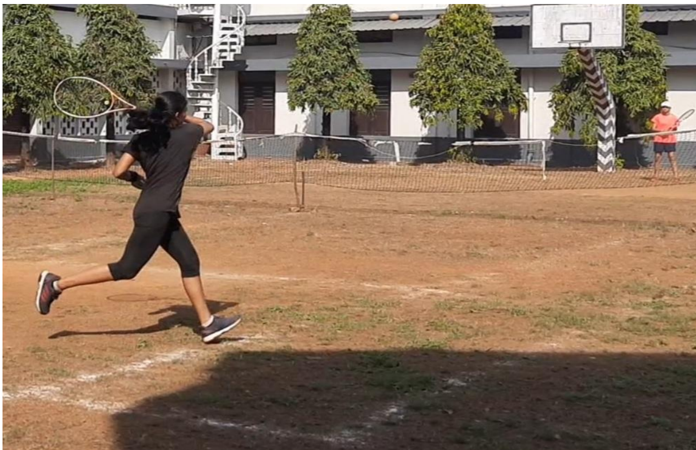
Students playing practise matches against the college team members