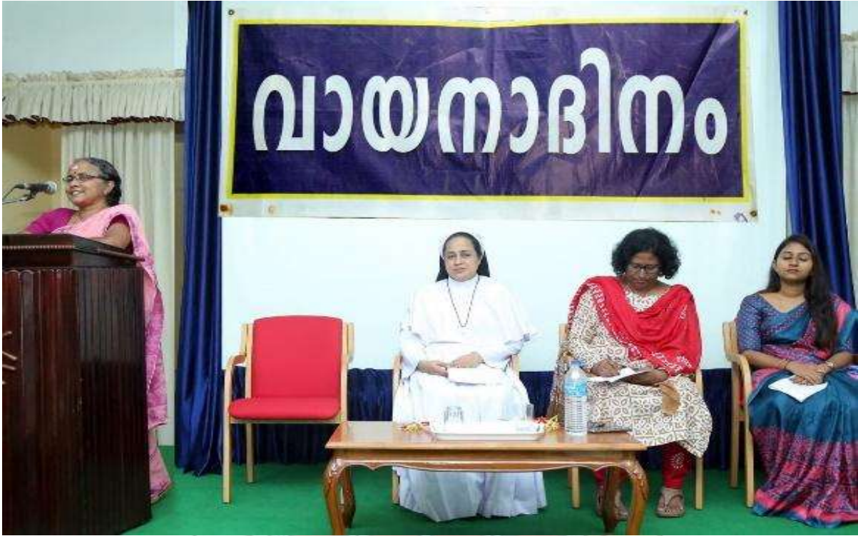
*Banner – Reading Day